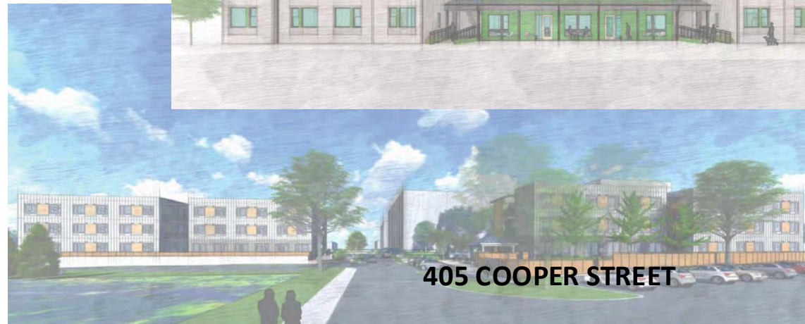
405 COOPER STREET